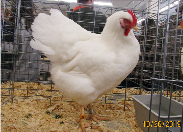
Kraig Shafer's BB White hen.