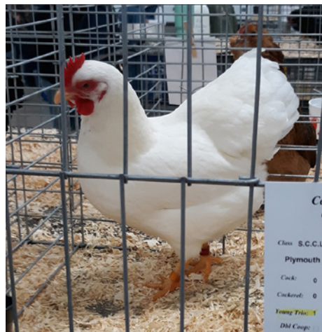
Kraig Shafer's Bantam White pullet won Res. of Breed