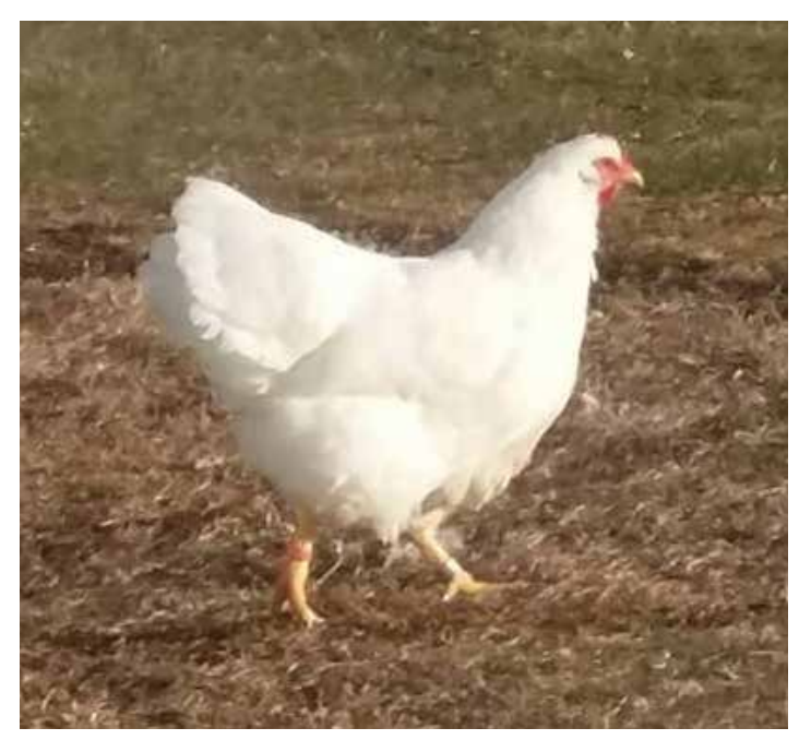
A Kraig Schafer White pullet on the yard.