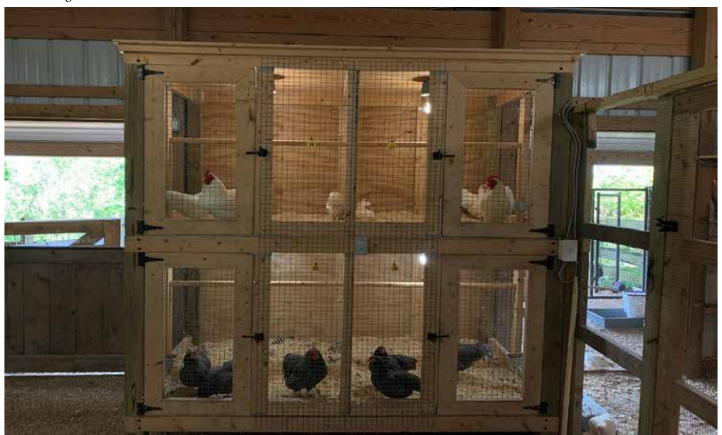
This is another one of my conditioning pens, although shown here as a breeding pen, this is where I house groups the groups of pullets until the weather prohibits them from being outside.

of like breeds and varieties in two pen designs (shown below), depending on what space is available. I house anywhere from two-four females in these pens where I can begin getting them used to being handled. It bothers me when Rocks, or any breed of a docile nature, are shown and are wild or difficult to catch for examination in the show hall, so I like to make sure mine are easy to grab and will not peck while being handled.