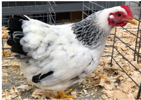
Yellow & blue card: BV Columbian hen, by Trevor Phillips