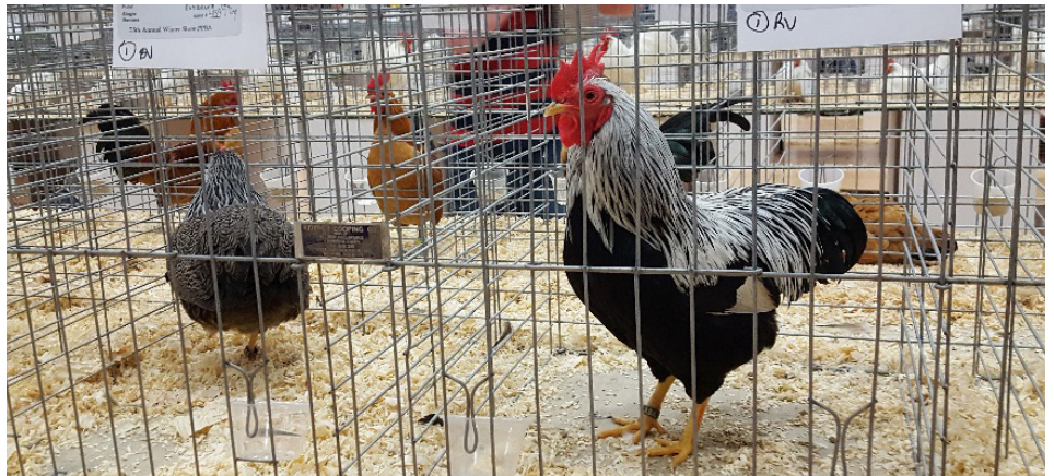
Silver Penciled bantam pen with BV pullet and RV cockerel, by Pam Watson