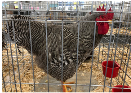
Blue card: BV/BB Barred cockerel, by Katrina Sallee; RV in yellow Card show