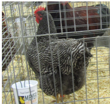
RV LF Barred pullet