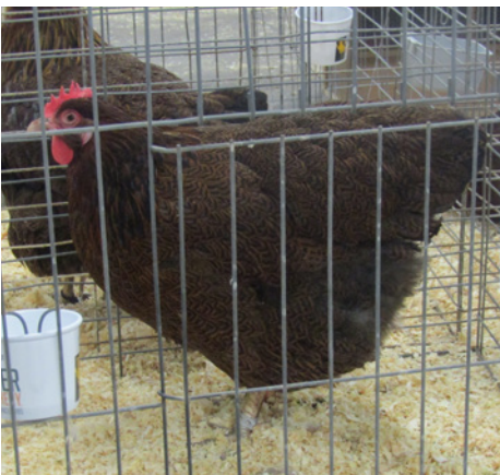
BV LF Partridge hen