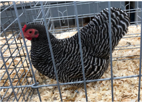
Yellow & blue card: RB, by junior Abby Smith