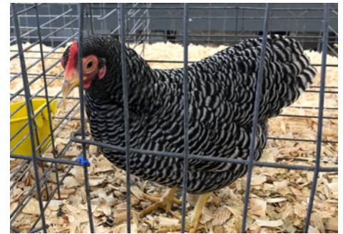
Blue card: RV Barred hen, by Louis Bacher