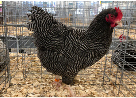
Blue card: RV/RB Barred hen, by Cassandra Everly