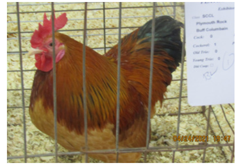
BV Buff Columbian bantam cockerel