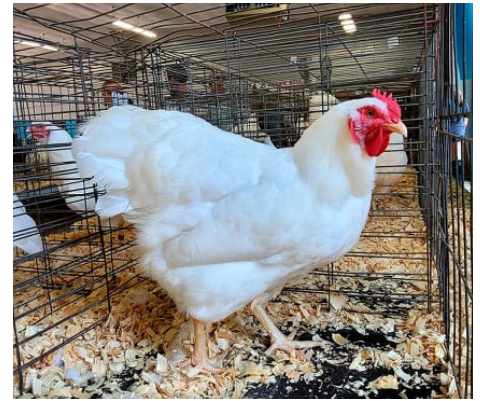
White card show: RB Large Fowl hen by Katrina Sallee