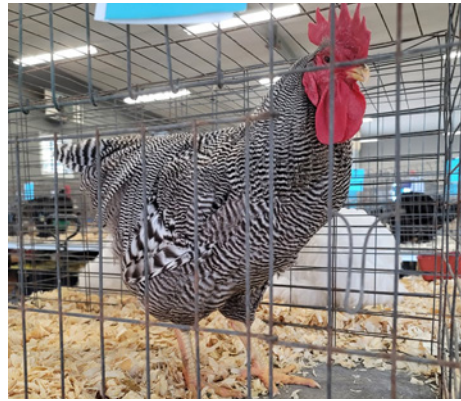
Blue card show: RB Large Fowl cockerel by Katrina Sallee