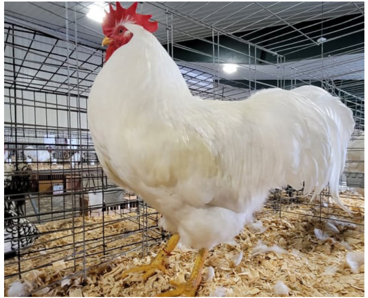
RB Large Fowl White cock by Kade Sallee