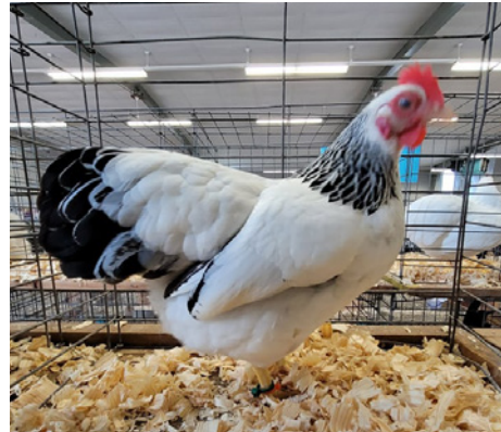
Blue card show: BB Bantam Columbian pullet by Gary Rossman