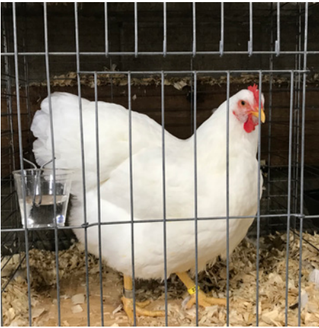
BB Large Fowl White pullet by Mark Beirbower

September 11-12, 2021, Steuben County Fairgrounds, Bath, NY