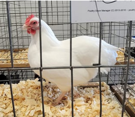
White card show: Best SCCL, BB Bantam pullet by Ron Patterson