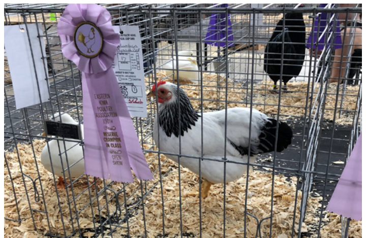
Reserve Champion SCCL Columbian pullet by Grant Tenley