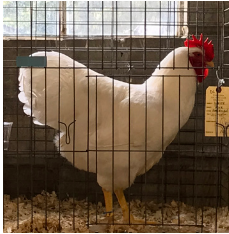
RB Large Fowl White cockerel by Jill Burks