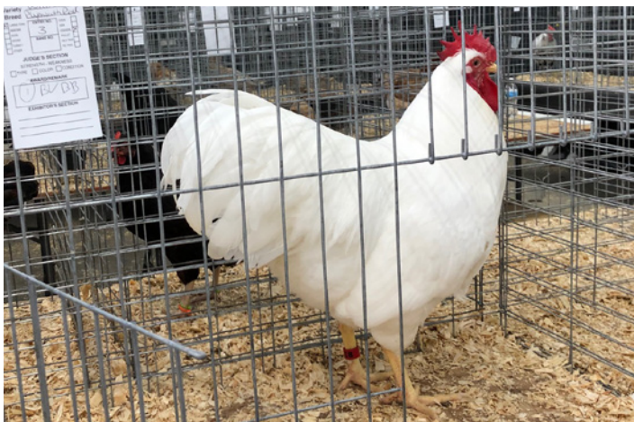
BB Large Fowl White cockerel by Dianne Weer