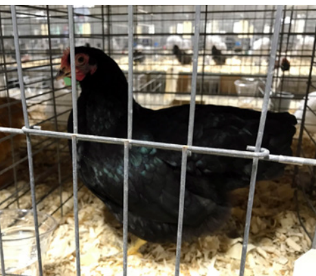
BV Bantam Black pullet by Norman Ennis