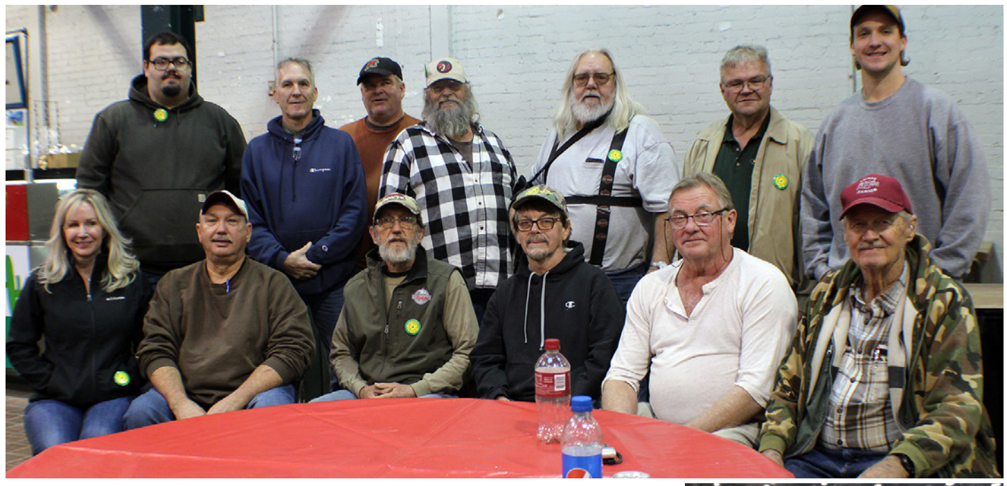
Big gathering of Rock Club members enjoying the show!

November 13-14, 2021, Ohio Poultry Breeders Association, Columbus, OH